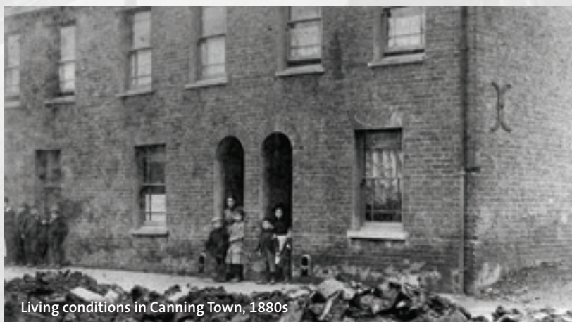
Living conditions in Canning Town, 1880s

Keir Hardie's own experiences of these harsh conditions would help shape his own views and lead to a lifetime of campaigning for improved rights and conditions for ordinary working people.