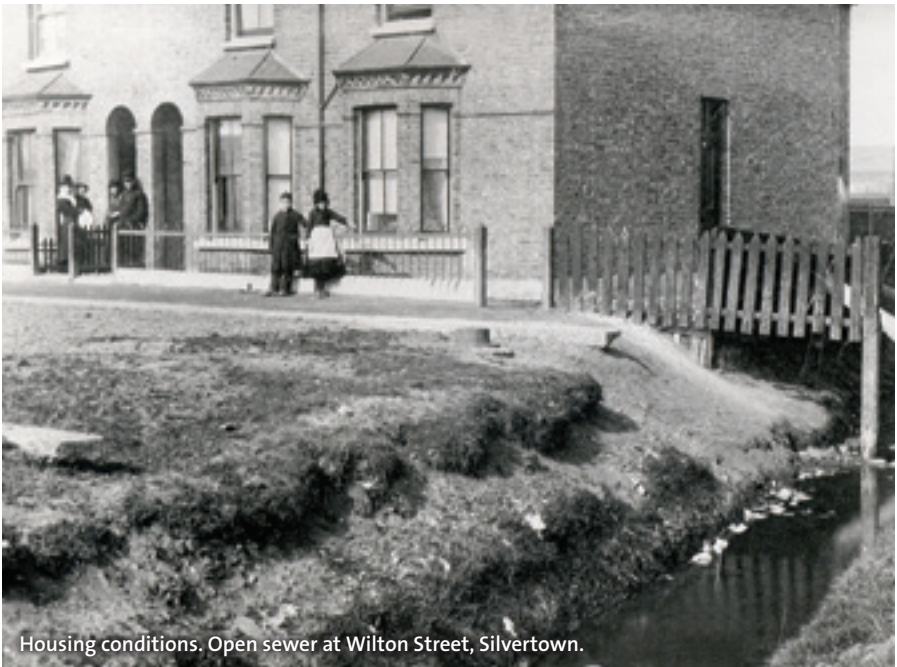
Housing conditions. Open sewer at Wilton Street, Silvertown.

At this time the labour movement was still in its infancy and it was not unexpected when Hardie lost the West Ham South seat in 1895. However, his manifesto and campaign for improved living conditions and workers' rights in Newham would be taken up by other local politicians across the generations and into the modern day. This would start in 1898 when West Ham Council would become the first Council in the UK controlled by socialists – an event which attracted newspaper coverage not only here in the UK but also across Europe and the USA.