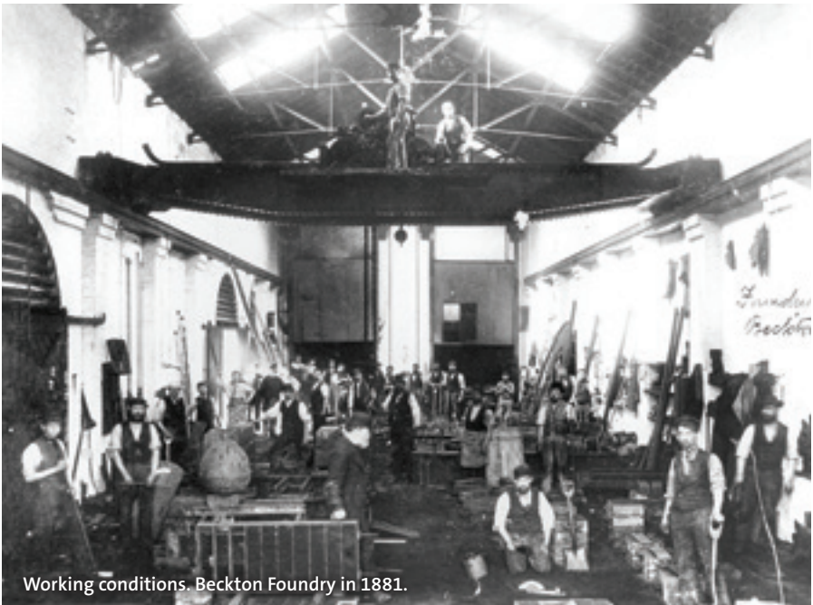
Working conditions. Beckton Foundry in 1881.

This incident was to lead to Hardie becoming a full time union organiser and representative of miners, fighting for improvements to their working conditions and organising a number of strikes in demand of improved pay. He also began to write as a journalist and set up a newspaper called The Miner .