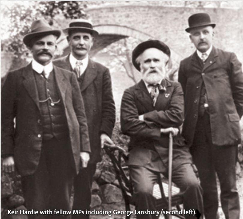
Keir Hardie with fellow MPs including George Lansbury (second left).

On taking his seat on 3 August 1892 Hardie refused to wear the 'parliamentary uniform' of black frock coat, silk top hat and starched wing collar. Instead, he chose to wear a plain tweed suit, red tie and deerstalker. This typical act of defiance was to mark Hardie out from other MPs during his time in Parliament. In 1893 he helped form the Independent Labour Party – the first national party with a specific aim of representing the rights of working class people. Hardie was to cause further controversy in Parliament when in 1894 after an explosion at a colliery in Pontypridd killed 251 miners, he asked that a message of condolence to the relatives of the victims be added to an address of congratulations on the birth of the future King Edward VIII. When this was refused he made a speech in Parliament attacking the monarchy which caused uproar in the House of Commons.